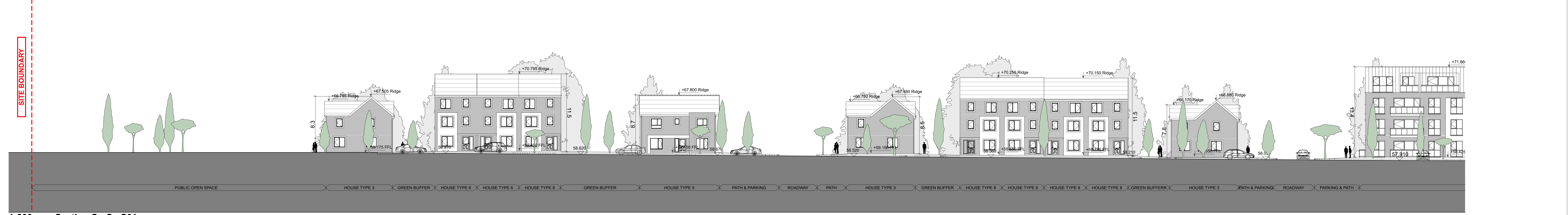
1:200 Section C - C - S01