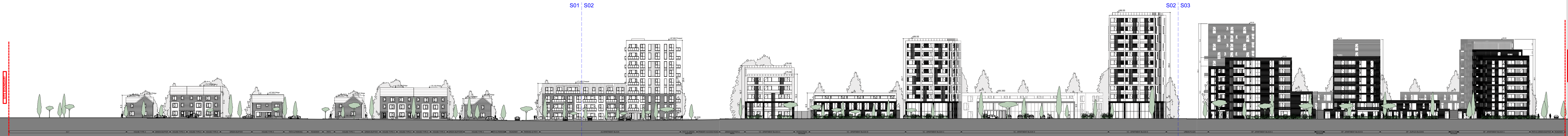
1:500 Section C - C