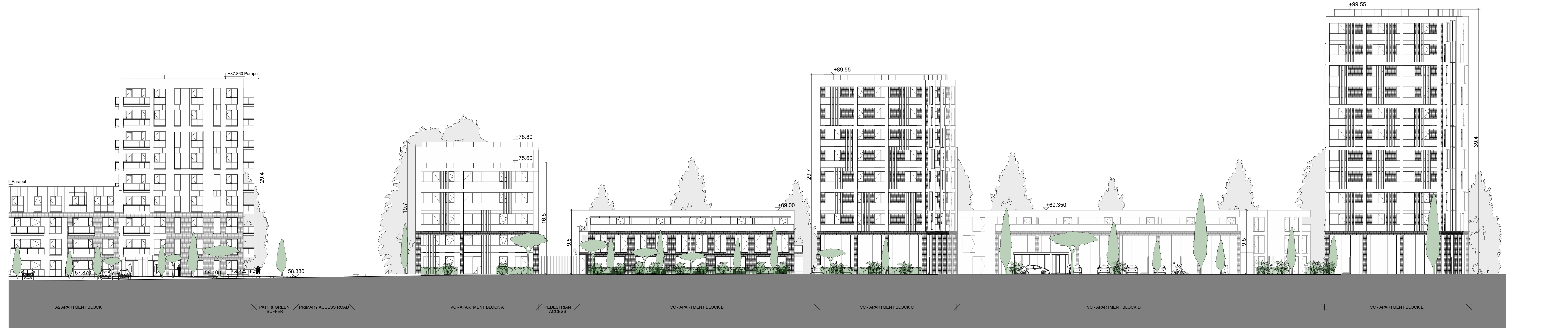
1:200 Section C - C - S02