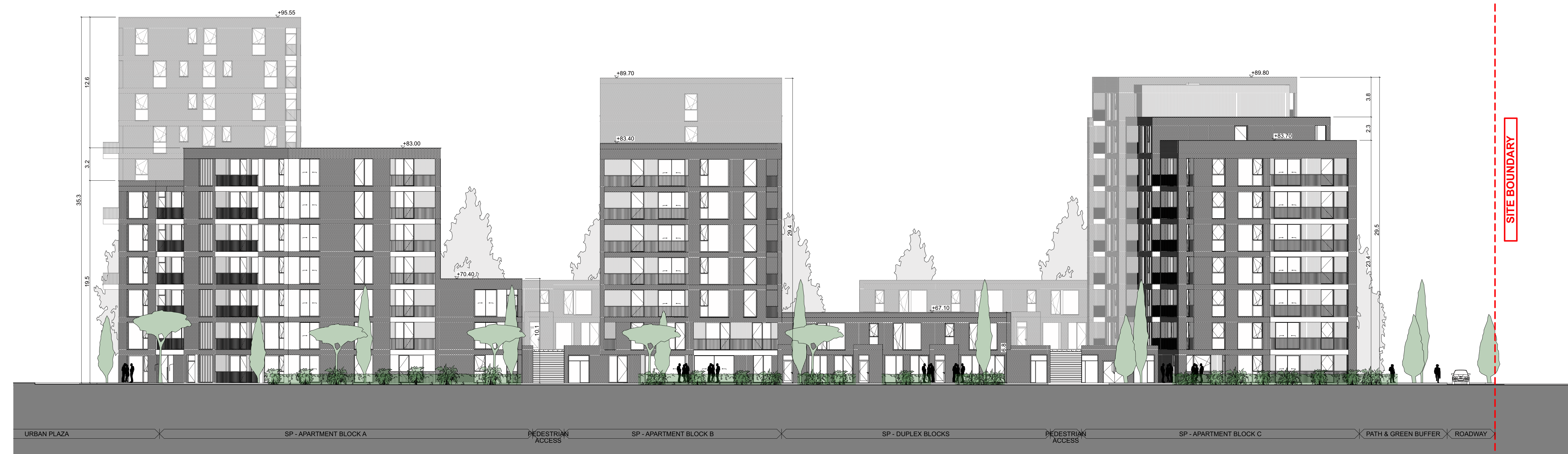
1:200 Section C - C - S03